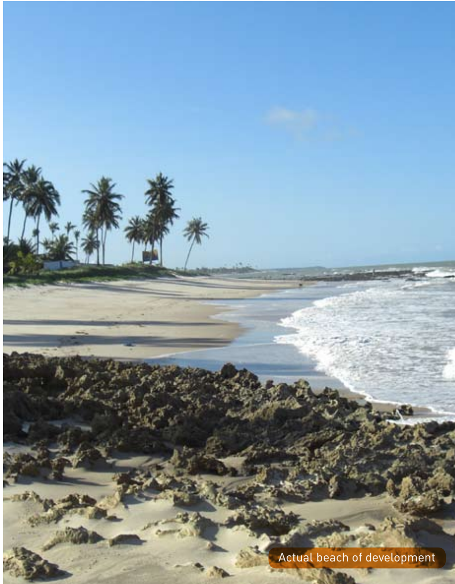
Actual beach of development

Just 31 apartments make up this small, select beachfront development and each one has a large, individual balcony with breathtaking views of the sea and beautiful white sandy beaches. Designed to accommodate the offshore breeze, they make sunbathing relaxed and comfortable and al fresco dining a must. They are ideal for socialising, entertaining friends and just chilling.