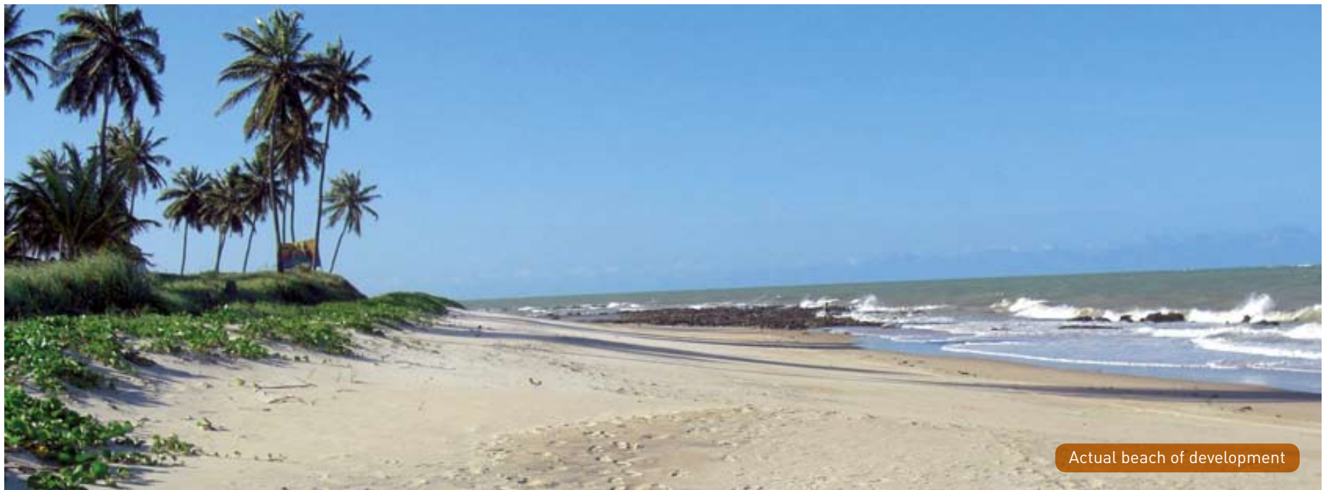
Actual beach of development